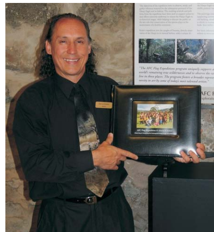
Flag Expedition Journal Collector's Edition

To read about the AFC Program, visit www.natureartists.com/flagexpeditions .