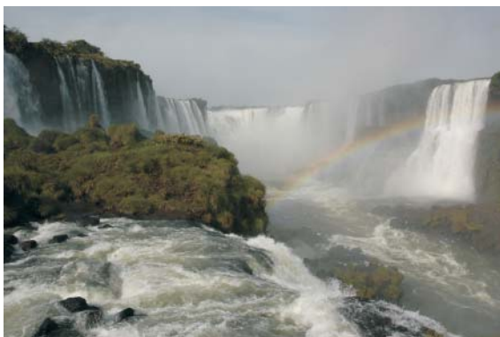
Iguassu Falls, Brazil

Some of the more exciting things you will do include: a visit to Iguassu Falls and the largest remaining area of sub-tropical forest that surrounds the falls; staying at a lodge in the Amazon jungle that has been