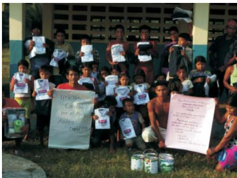
A big "Thank You" from the children of Llano Bonito

In April 2008, once again with the logistical support of Advantage Tours ( www.advantagepanama.com ), another