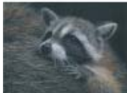
Racoons (Young) Diptych

David also continues to teach a number of wildlife in acrylic workshops , which are open to artists of all skill levels. Whether you have always wanted to try acrylics but did not know where to start, or whether you have been using this versatile medium but want to further