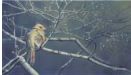
Spring Arrival - Cardinal