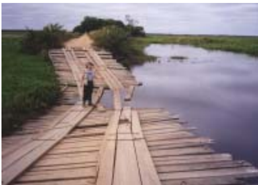
In order to travel the 146 km of the Transpantaneira (the only road in the Pantanal), David had to cross over 100 bridges, some of which are in need of a "little" maintenance...

back to the Pantanal (he was there for a short time in 1993). The Pantanal is the largest continental wetland on Earth, covering more than 77,000 sq. miles. It is located at the heart of Brazil, just south of the Amazon rainforest, and is home to over 650 species of birds, 80 species of mammals and 50 species of reptiles.