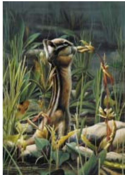
"A Little Off the Top" 11" x 15 1/4" Acrylic on Baltic birch

David has been blessed with the support of a wonderful group of collectors. So much so, that some of David's paintings hardly have the time to dry before they are snatched away.