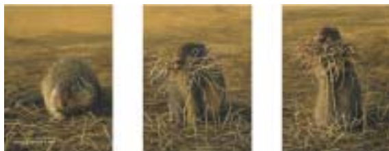
“Ground Squirrel Study” Open Edition 3 @ 5” x 7”