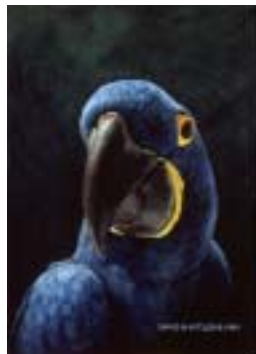
“Macaw Study” 5” x 7” Acrylic on hardboard