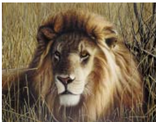
"Portrait of a King" 18 1/2" x 14 1/2" 260 s/n US$77 Can$99

You should be able to see this new print at any of our upcoming shows. If you would like to pre-order a print or, if you own one of the "Lady in Waiting" prints and would like to reserve a print of the same number on