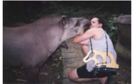
This tapir wanted to ensure that she would be in the picture. (Ilha dos Porcos Grandes, Angra dos Reis, RJ)

Dr. Pitanguy is an internationally renowned cosmetic surgeon with a life-long passion for preservation. Fifteen years ago he bought an island in the Angra dos Reis archipelago, off the coast of Rio de Janeiro, called Ilha dos Porcos Grandes. He has since transformed it into a wildlife sanctuary containing over 600 wild animals. There